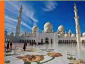
Sheikh Zayed Grand Mosque